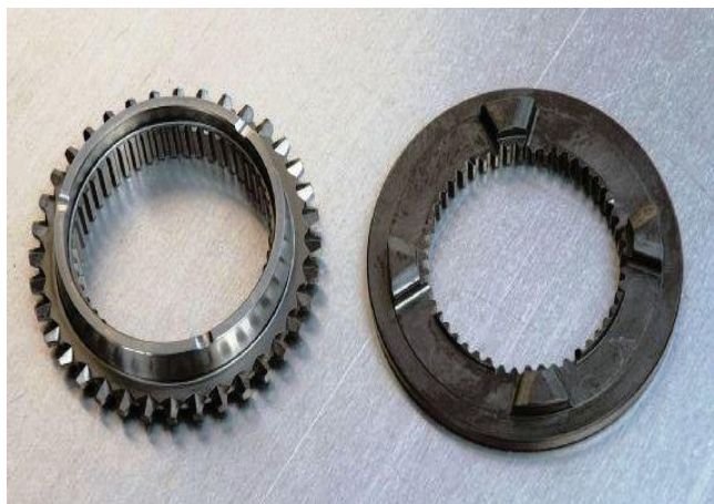
Figure - Dog ring [6]