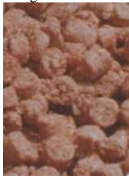
Figure 2: pelleted feed