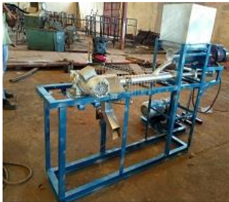
Plate 1: pelleting machine