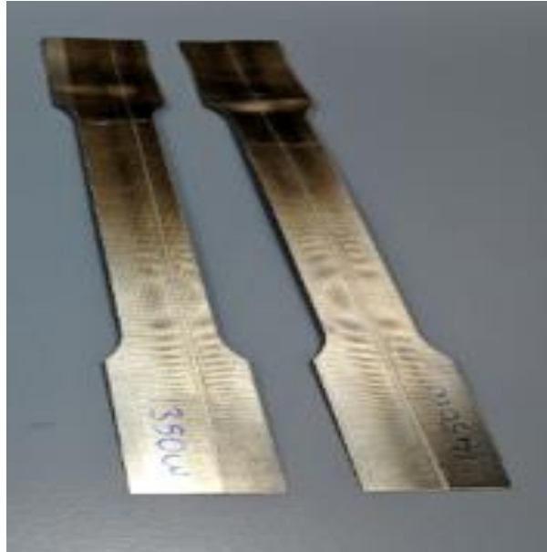
Fig. 2: Sample pieces for tensile test

Tensile tests were applied 90° perpendicular on the machined samples to rolling direction accordance with DIN 50125 and DIN EN ISO 6892-1. Tensile tests were performed with ZWICK / ROELL 20kN tensile device. The mounted samples on the device have been shown in Figure 3.