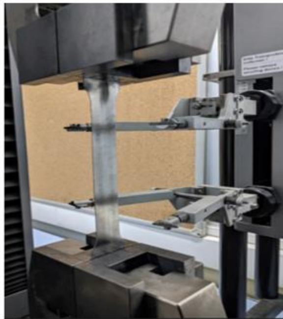
Fig. 3: Mounted sample before tensile test

Tensile tests were applied 90° perpendicular on the machined samples to rolling direction accordance with DIN 50125 and DIN EN ISO 6892-1. Tensile tests were performed with ZWICK / ROELL 20kN tensile device. The mounted samples on the device have been shown in Figure 3.