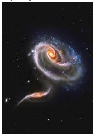
Picture 4: rose gold galaxy (I think the planets that are formed or will be formed at gold rose galaxy have same spin and gravity like earth because the formation of the rose gold galaxy is very close to the formation of the milky way.

Appendix 1: Schematic plan: travel faster than the speed of light by using a black hole this travel started from the earth and use the black hole in a milky way and continued to the rose gold galaxy