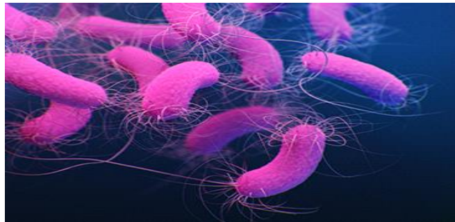
picture 3: negative germ (above sample is a laboratory sample but there is an industrial sample that I am thinking about it)