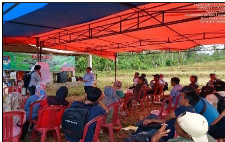
Figure 3: Farmer Training

Furthermore, the efficacy of technical training is contingent upon farmers' intrinsic motivation and inclination to adopt innovations. Some farmers, who have traditionally relied on conventional methods, exhibit reluctance to adopt new practices. This underscores the significance of a sociocultural approach in the design of training programs, wherein educational materials are customized to address local requirements and delivered in a participatory manner. Experiential learning and field school visits have been demonstrated to be more effective in fostering farmers' awareness and commitment.