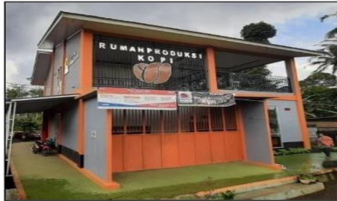
Figure 2: Coffee Production House

The facilities and infrastructure aspect is also a major concern for stakeholders. The local government through the Agriculture Office provides a production house complete with roasting equipment, packaging machines, and solar dryer/dom. As stated by the Head of Plantation, "We provide assistance in the form of production houses per sub-district and are equipped with roasting machines and solar dryer doms to maintain coffee quality." (Norman, 2025)